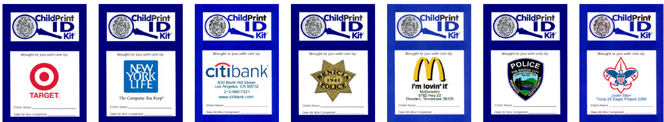
Samples of Custom Kits we have produced