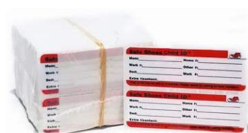
Safe Shoes Child ID Kit and Label Pack of 250 pairs